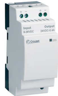
6 → 10 w DC/DC converter