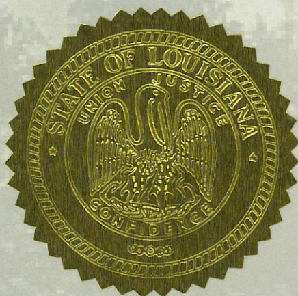
John Bel Edwards Governor

IN WITNESS WHEREOF, I have hereunto set my hand officially and caused to be affixed the Great Seal of the State of Louisiana, at the Capitol, in the City of Baton Rouge, on this 24th day of September A. D., 2023 .