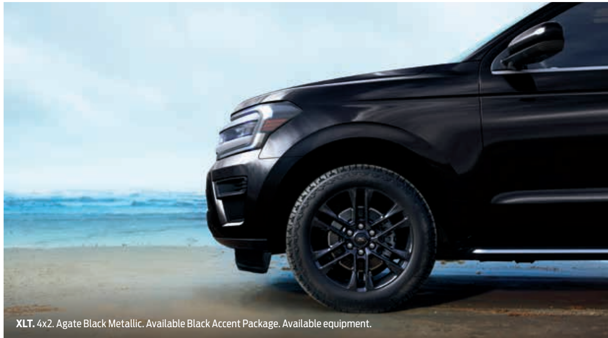
XLT. 4x2. Agate Black Metallic. Available Black Accent Package. Available equipment.

Ford Expedition XLT has what it takes to take your whole crew just about anywhere. Available ActiveX™ Trimmed Seats offer a comfortable space for passengers, while a PowerFold® 3rd-row seat folds flat with the touch of a button making it easy to carry more cargo. Loading cargo is easy too, thanks to the available power liftgate. Available 4-door Intelligent Access means with the key fob on your person, any passenger door unlocks with just the touch of a door handle. Once inside, available ambient lighting brightens the interior. With the available Black Accent Package , the Expedition XLT SUV will turn heads with 20" 6-spoke Gloss Black-painted aluminum wheels and Gloss Black-painted accents that add style and elegance to the monochromatic exterior.