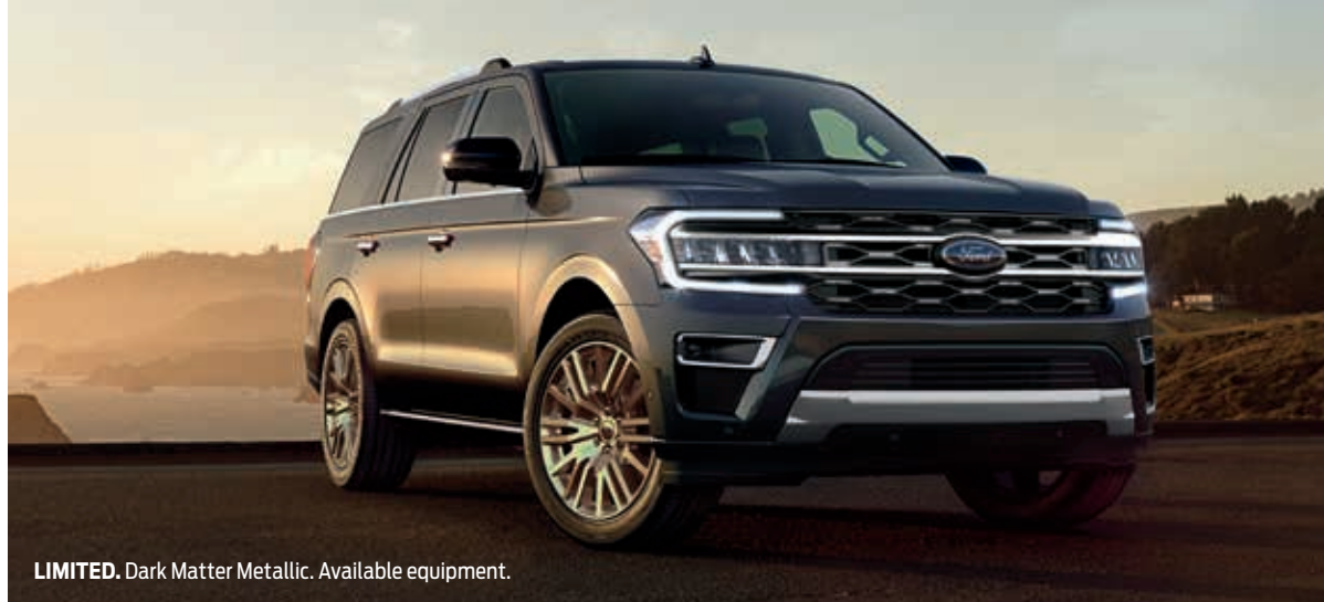
LIMITED. Dark Matter Metallic. Available equipment.

Everything about the Ford Expedition® Limited SUV was designed with you in mind. Inside, heated and ventilated leather-trimmed front seats with a convenient driver's memory feature that recalls saved settings wrap you in comfort, while a power-tilt/-telescoping steering column and power-adjustable pedals let you fine-tune things just so. A power, panoramic Vista Roof® opens up to let the sun shine in, and power-deployable running boards add that little something extra.