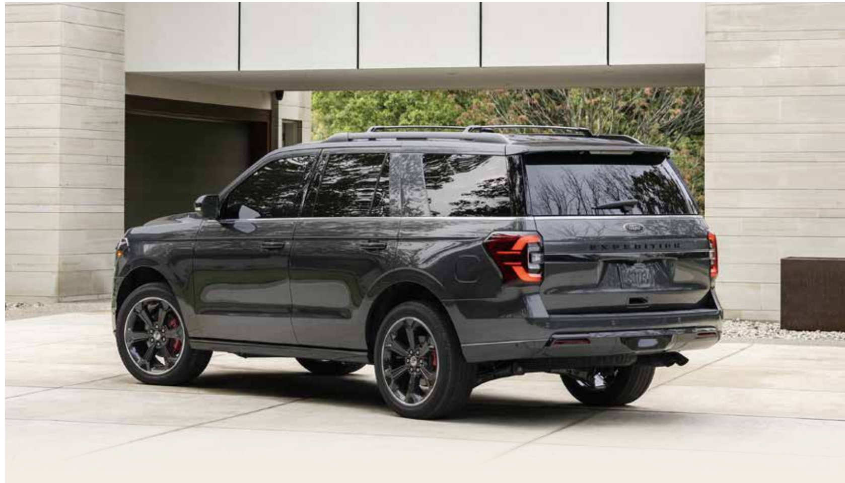
STEALTH. Dark Matter Metallic. Available equipment.

SHOP THE COMPLETE COLLECTION | accessories.ford.com