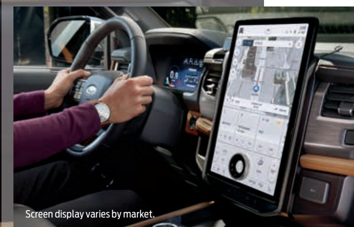
Screen display varies by market.