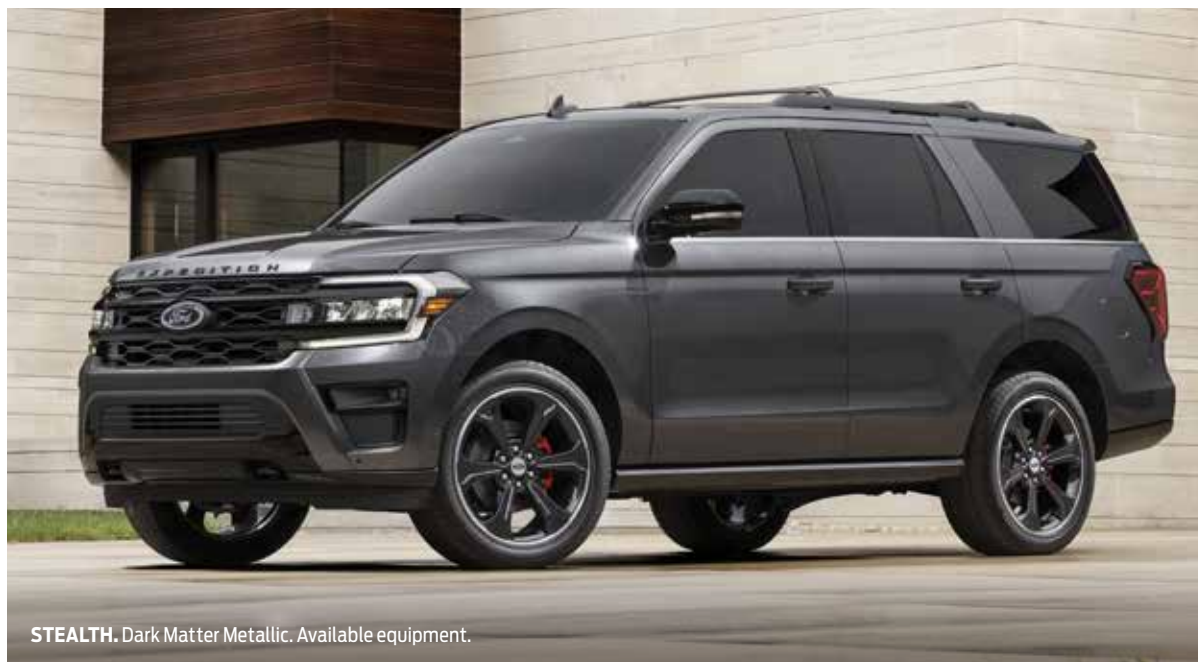
STEALTH. Dark Matter Metallic. Available equipment.

With a sleek appearance and enhanced power , the Stealth Performance Edition is equipped with a High-Output 3.5L EcoBoost® Twin-Turbo V6 engine that delivers 440 hp 1,2 and 691 Nm of torque. 1,2 Ebony Black accents all around provide a monochromatic appearance outside, while EXPEDITION lettering on the hood, massive 22" premium black-painted aluminum wheels and red performance-tuned brakes let you know this model is something special. Inside, the best-in-class 3 22-speaker B&O® Unleashed Sound System provides concert hall sound, while unique red stitching sets the interior apart. Standard driver-assist technology upgrades include Ford Co-Pilot360™ Assist 2.0, which includes a 360-Degree Camera with Split-View Display, Reverse Brake Assist and Active Park Assist 2.0. In every way, Expedition Stealth offers luxury on a grand scale.