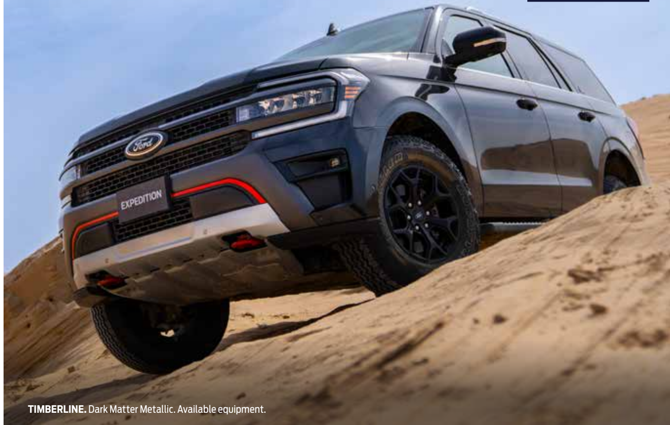
TIMBERLINE. Dark Matter Metallic. Available equipment.