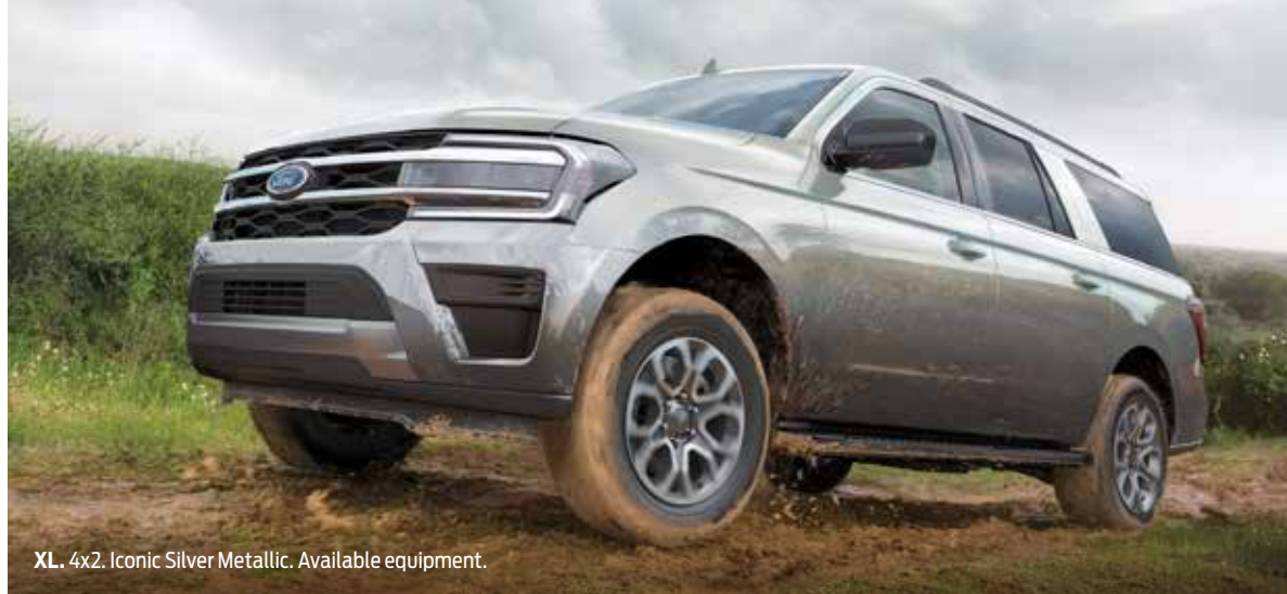
XL. 4x2. Iconic Silver Metallic. Available equipment.

Ford Expedition® XL SUV delivers. With a 380-hp 3.5L EcoBoost® engine, XL makes it easy to get where you need to go – with what you need to take with you. Pair that with 18" machined-face aluminum wheels with Magnetic-painted pockets, and you get rugged good looks and at-the-ready power in one powerful model. And, new SYNC® 4 with a 12" touchscreen and voice-activated technology 1 provides wireless Apple CarPlay® and Android Auto™ compatibility , 2,3 keeping you conveniently connected virtually everywhere you go.