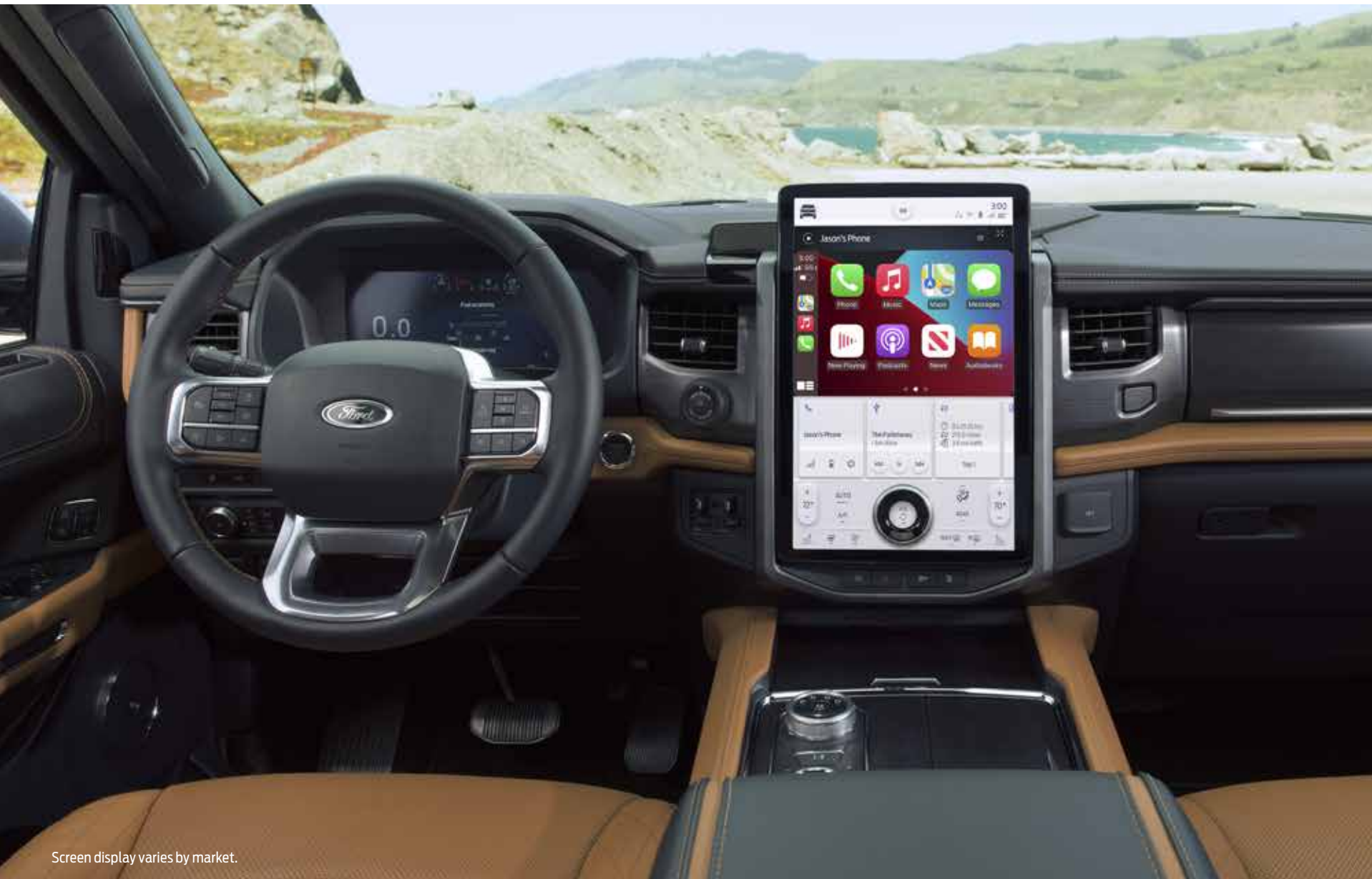
Screen display varies by market.