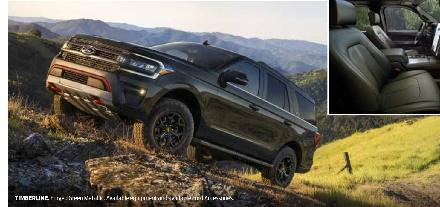
TIMBERLINE. Forged Green Metallic. Available equipment and available Ford Accessories.

With enhanced power and off-road capability , Ford Expedition Timberline™ SUV is outfitted with a High-Output 3.5L EcoBoost Twin-Turbo V6 engine that delivers 440 hp 4,5 and 691 Nm of torque. 4,5 Front, rear and underbody steel skid plates offer protection when the going gets tough. Off-road-tuned front and rear shocks and an electronic limited-slip differential help out as well. 269 mm of ground clearance with improved approach and departure angles thanks to the off-road Ford F-150® RAPTOR™ inspired front bumper, the 2022 Ford Expedition Timberline helps you get into – and out of – the rough stuff. And there's no mistaking the Timberline look. Black Ford Oval badging, a blackout treatment on the headlamps and taillamps, and Ember Red accents let you know Timberline means business. Inside, 2 unique interior options complete the difference.