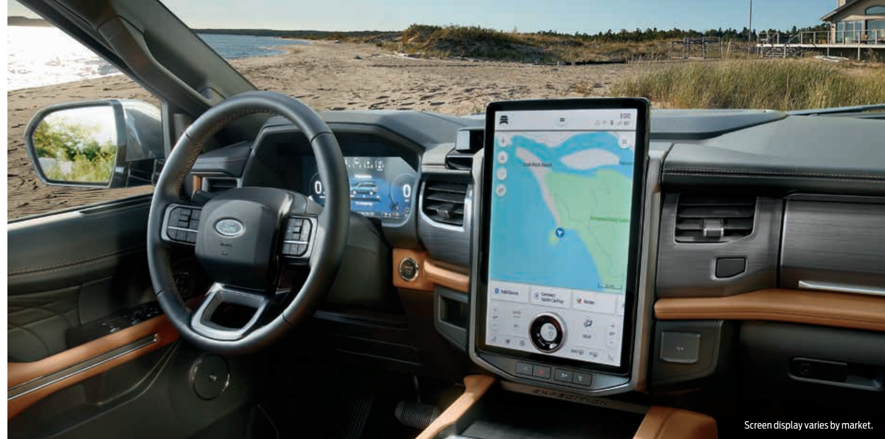
Screen display varies by market.

A simple turn of the rotary gear shift dial easily moves you from Park to Reverse to Drive. Available 4WD with the Terrain Management System™ offers 7 Selectable Drive Modes , while the available best-in-class 1 12.4" digital instrument cluster lets you configure the look and function of the gauges. The 2022 Ford Expedition® SUV liberates immersive sound from the available best-in-class 1 B&O® Unleashed 22-Speaker Sound System with 1,080 watts of power. It can make every song sound like an in-person concert. A 12-speaker B&O Play Sound System offering 680 watts of digitally processed sound is also available.