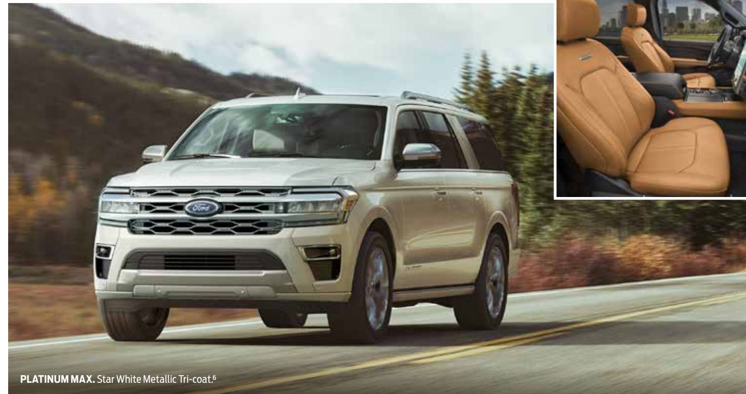
PLATINUM MAX. Star White Metallic Tri-coat. 6

From the power of a 3.5L EcoBoost® Twin-Turbo V6 engine to the massive 22" 12-spoke polished aluminum wheels and power-deployable running boards, this Ford Expedition SUV is the real deal. A 15.5" LCD capacitive touchscreen , the largest in its class, 3 enhances new SYNC® 4 voice-activated technology. 5 While a 12.4" Multicolor Productivity Screen in the instrument cluster accompanies it. Available leather-trimmed heated and ventilated multicontour front seats with Active Motion® deliver relaxing comfort to both the driver and passenger, while 1st- and 2nd-row seats boast perforated inserts and quilted bolsters. A leather-wrapped instrument panel top, wood accents, a power, panoramic Vista Roof and the 22-speaker B&O Unleashed Sound System combine to make the Platinum® trim level quite a pleasure.