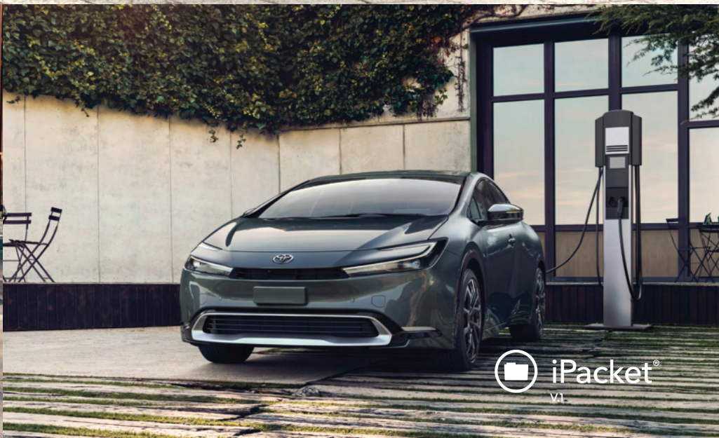
EXTERIOR: PRIUS PHEV