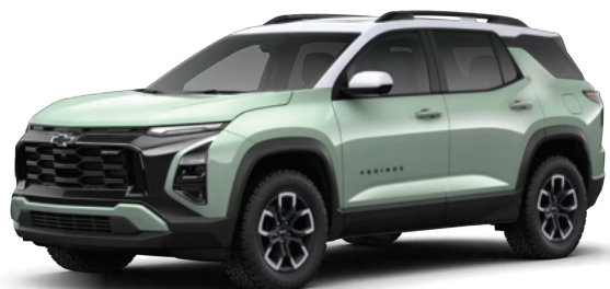
Cacti Green/ Summit White