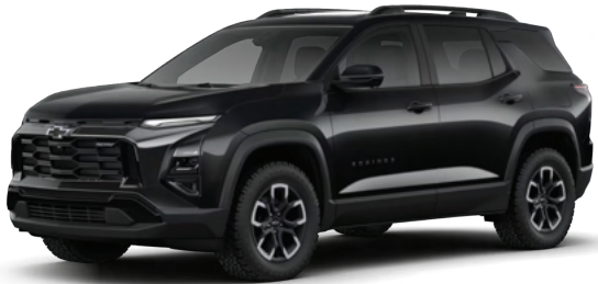
Mosaic Black Metallic