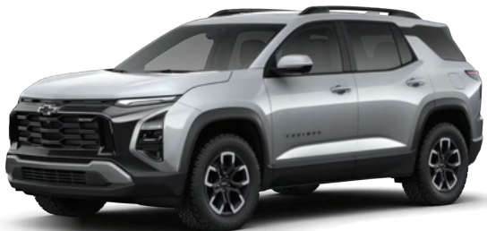
Sterling Gray Metallic