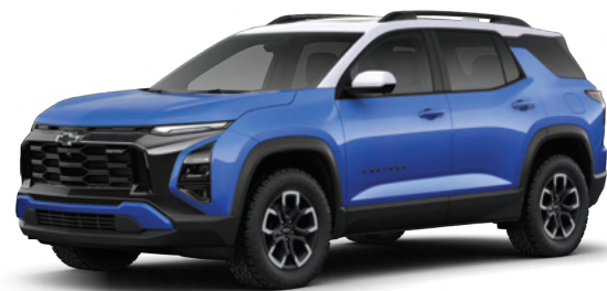
Reef Blue Metallic/ Summit White