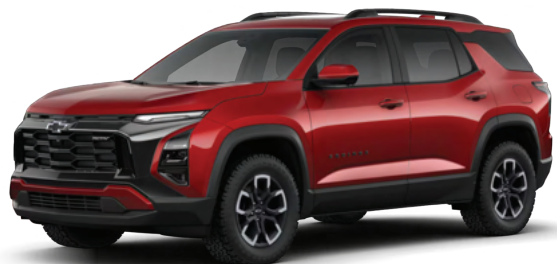
Radiant Red Tintcoat