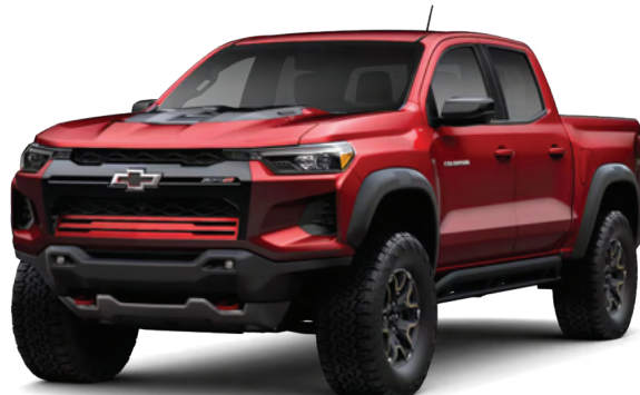
Radiant Red Tintcoat