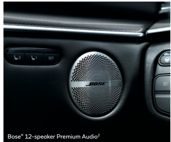
Bose ® 12-speaker Premium Audio 2

Transform your commute with standard ProPILOT Assist , which can automatically react to the flow of highway traffic by braking and coming to a complete stop and then accelerating up to speed again. 1,6 Even around gentle curves, QX50 can help steer to keep you centered in your lane. Once you arrive, maneuver tight parking with ease as the available Around View ® Monitor with Moving Object Detection grants a virtual 360° view from above and shows you obstacles it detects in motion. 7,8