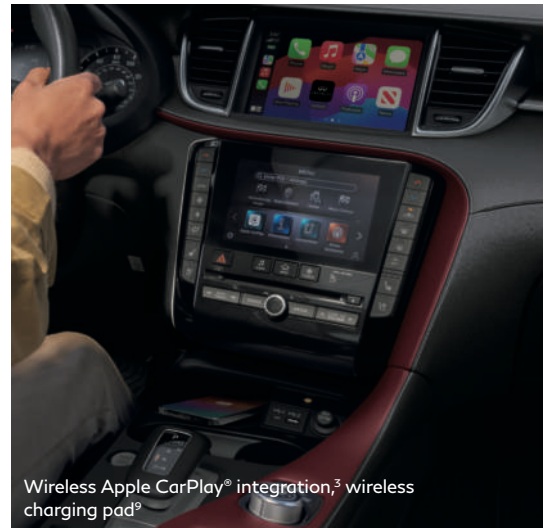
Wireless Apple CarPlay ® integration, 3 wireless charging pad 9