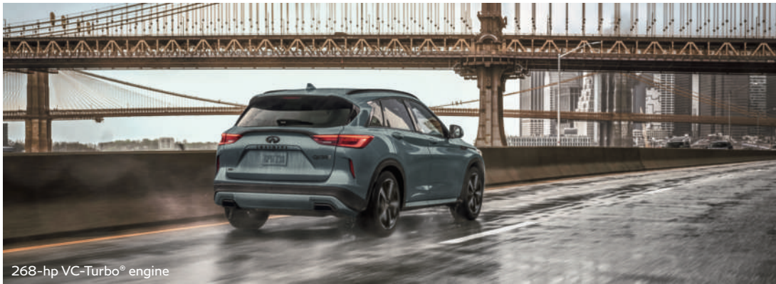
268-hp VC-Turbo ® engine