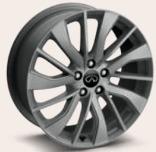
19 X 7.5-inch silver-painted aluminum-alloy wheels