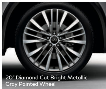
20" Diamond Cut Bright Metallic Gray Painted Wheel