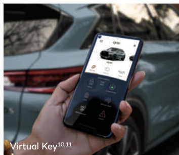
Virtual Key 10,11