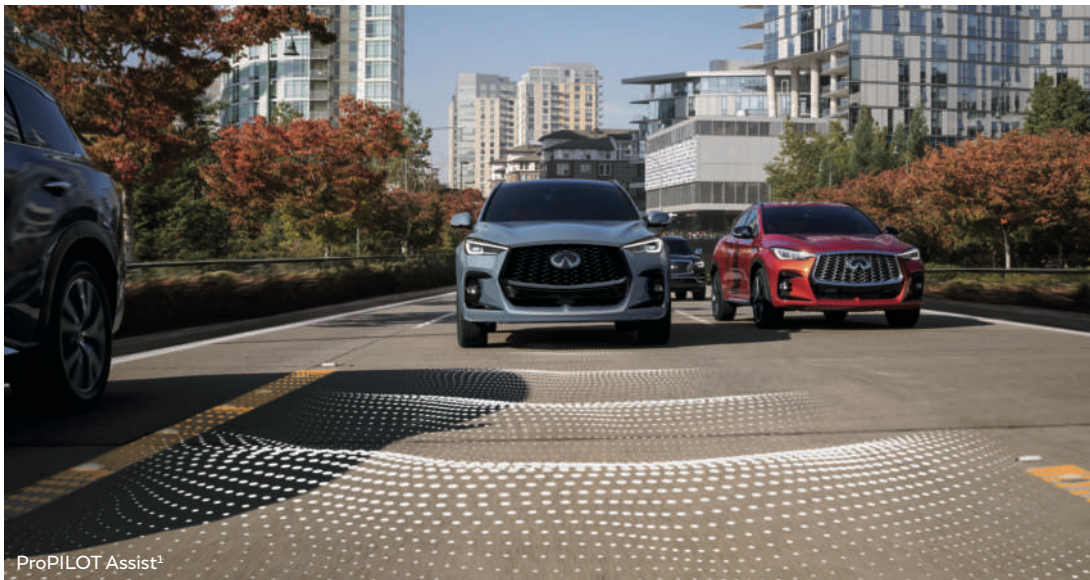
ProPILOT Assist 1