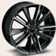
20 X 8.5-inch dark-painted and machine-finished aluminum-alloy wheels**

*INFINITI has taken care to ensure that the color swatches presented here are the closest possible representations of actual vehicle colors. Swatches may vary slightly due to the printing process and whether viewed in daylight, fluorescent or incandescent light. Please see the actual colors at your retailer. **Extra cost option.