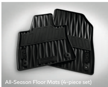
All-Season Floor Mats (4-piece set)