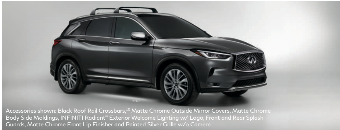
Accessories shown: Black Roof Rail Crossbars, 13 Matte Chrome Outside Mirror Covers, Matte Chrome Body Side Moldings, INFINITI Radiant® Exterior Welcome Lighting w/ Logo, Front and Rear Splash Guards, Matte Chrome Front Lip Finisher and Painted Silver Grille w/o Camera