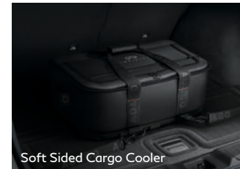
Soft Sided Cargo Cooler

Illuminate your aesthetic. INFINITI Radiant® Exterior Welcome Lighting w/ Logo brightens up the area beneath and around your QX50 for an added sense of security and style. With Virtual Key , the driver can grant up to seven additional users access to lock or unlock doors, start the engine and open the liftgate. 10,11