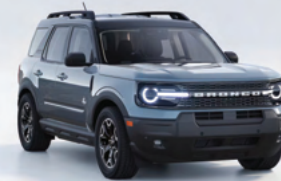
Azure Gray Metallic