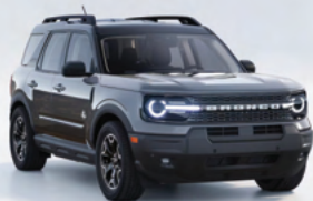
Carbonized Gray Metallic