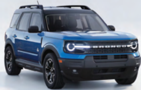
Velocity Blue Metallic