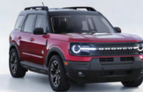
Ruby Red Metallic