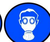
Particle Mask / Respirator