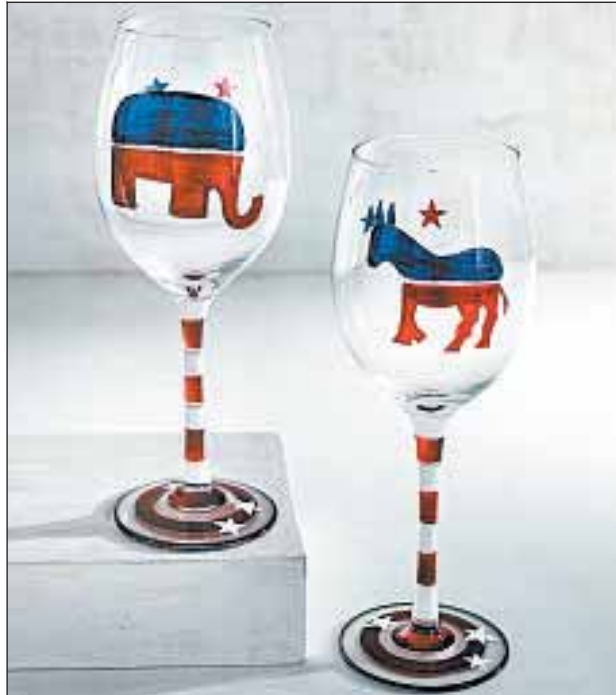
PIER 1 IMPORTS

These bamboo serving boards combine state pride and a love for snacks, so you can watch the election results with a warm heart and a full belly. Bamboo state serving boards, $14.99-$19.99, Bed Bath & Beyond stores and www.bedbathandbeyond.com .