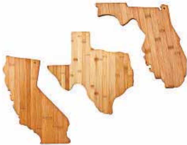
BED BATH & BEYOND