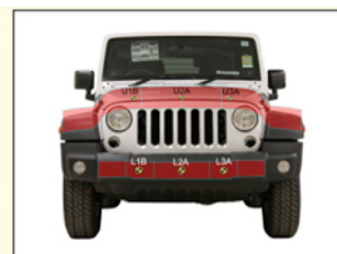
Adult leg impact (upper and full legforms)