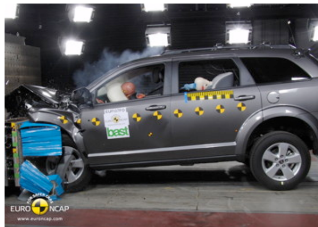
Frontal offset test at 64 km/h (Euro NCAP)

Note: This rating is based on Euro NCAP tests of the diesel left-hand-drive European model.