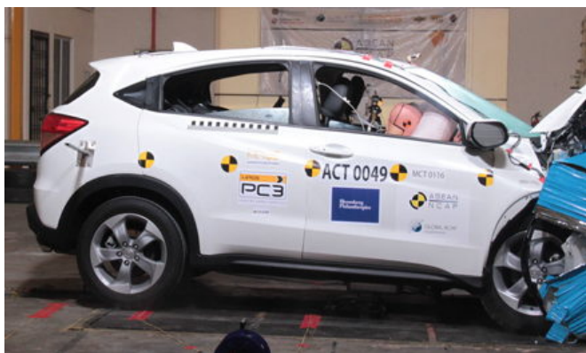
Frontal offset test at 64km/h (ASEAN NCAP)