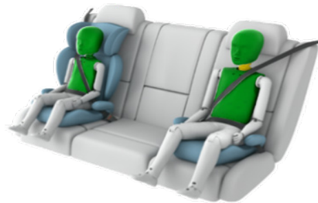
SIDE IMPACT TEST - 60km/h