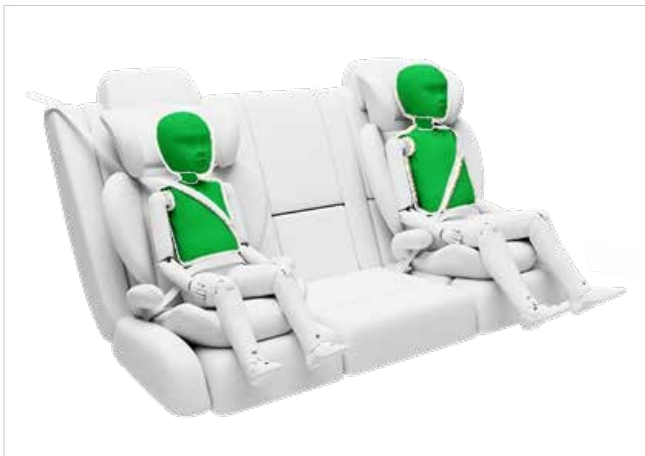
6 YEAR OLD