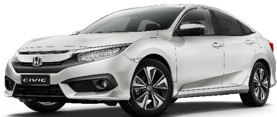
Honda Civic Sedan