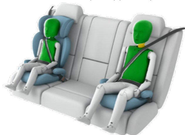
6 YEAR OLD