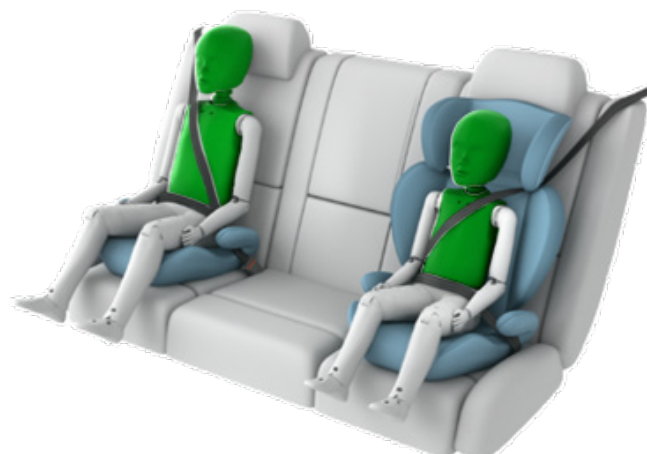
10 YEAR OLD