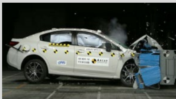
Frontal offset test at 64km/h