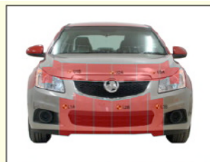
Adult leg impact (upper and full leg/forms)