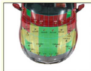
Child and adult head impact