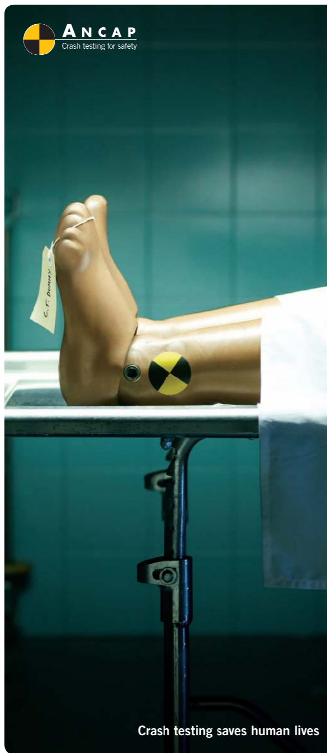
Crash testing saves human lives

To simplify the crash test results ANCAP has assigned an occupant protection rating based on an overall score, which is portrayed as a star rating out of 5 – the more stars the better.