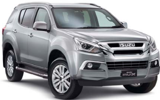
Isuzu MU-X (MY17)