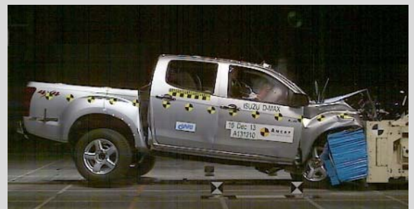
Frontal offset test at 64km/h (Isuzu D-Max)