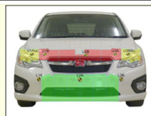
Adult leg impact (upper and full legforms)