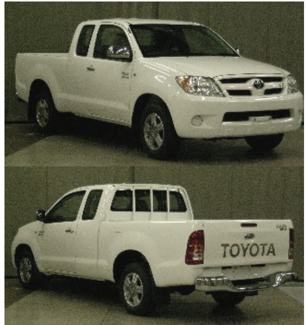
Toyota Hilux Extra Cab