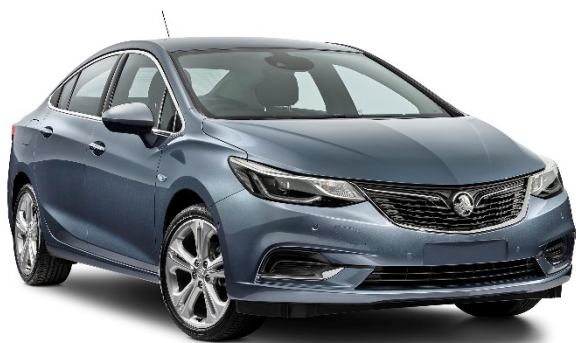
Holden Astra sedan