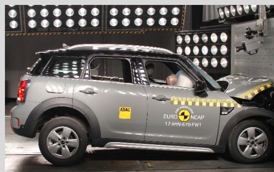
Full width frontal test at 50km/h