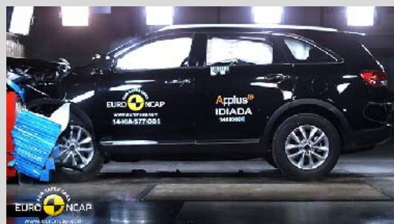
Frontal offset test at 64km/h.