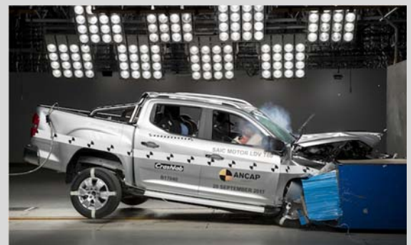
Frontal offset test at 64km/h