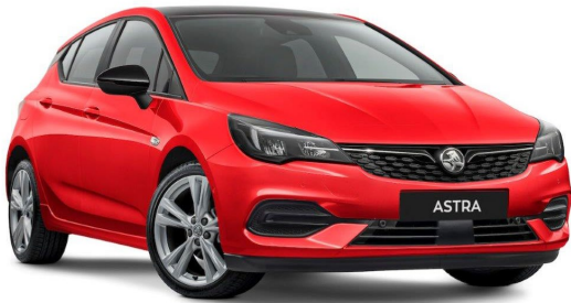
Holden Astra Hatch