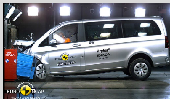
Frontal offset test at 56km/h