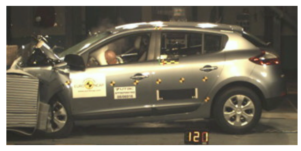
Offset crash test at 64km/h (Euro NCAP)