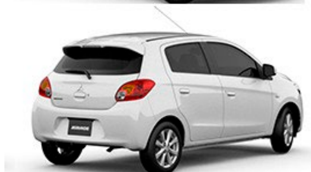
Mitsubishi Mirage hatch