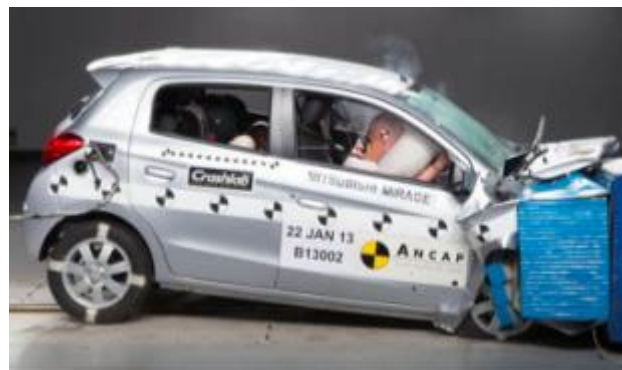
Frontal offset test at 64 km/h