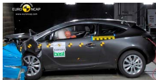
Offset crash test at 64km/h (Euro NCAP)