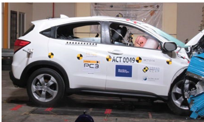
Frontal offset test at 64km/h (ASEAN NCAP)