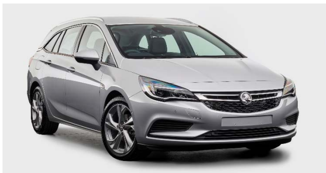
Holden Astra Sportwagon