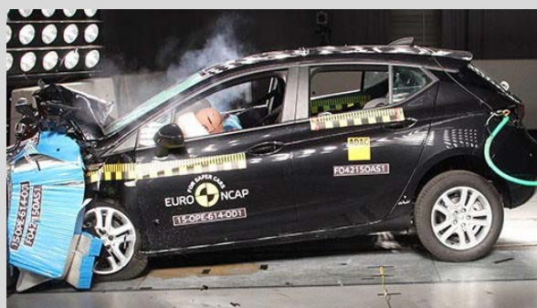
Frontal offset test at 64km/h (Astra hatch)