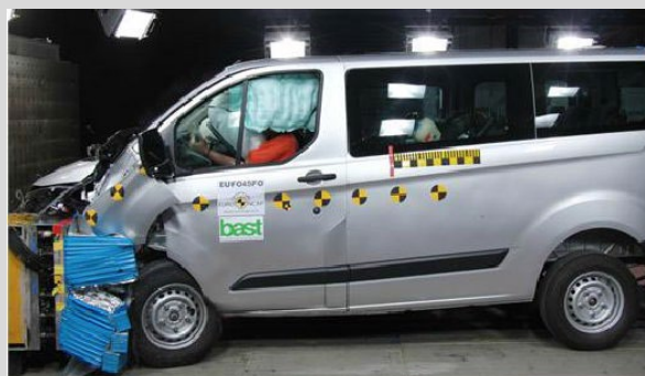
Frontal offset test at 56km/h (Ford Transit Custom)