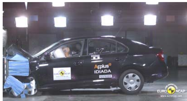
Frontal offset test at 64 km/h (Euro NCAP)