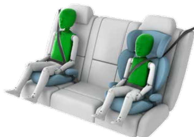
10 YEAR OLD