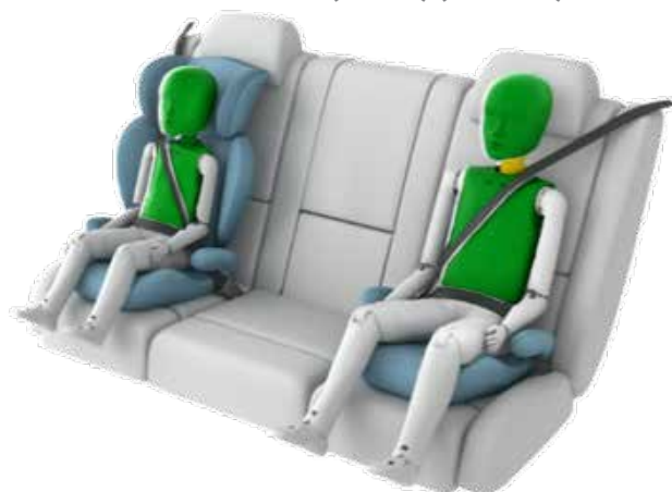
6 YEAR OLD