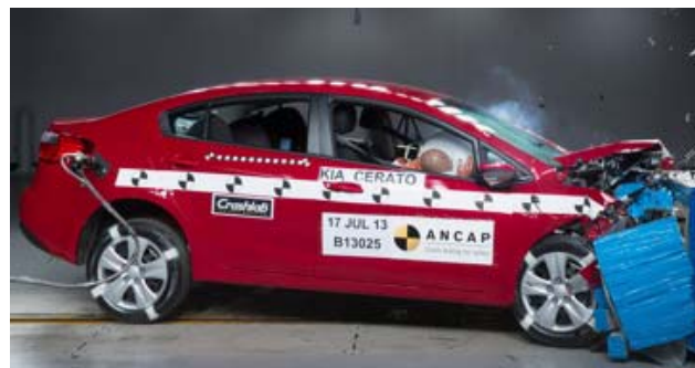
Frontal offset test at 64 km/h (ANCAP crash test of sedan)

Note: This rating is based on ANCAP crash tests of the Cerato sedan. ANCAP was provided with information which showed that the rating also applies to the Cerato Koup.