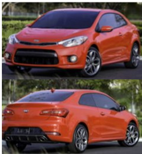
Kia Cerato Koup