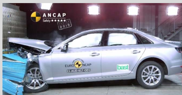
Frontal offset test at 64km/h (Audi A4 pictured)