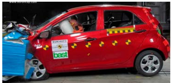
Offset crash test at 64km/h (Euro NCAP)