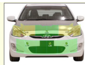
Child and adult head impact