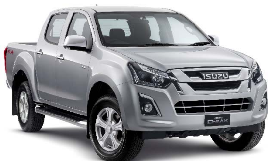
Isuzu D-Max Crew Cab (MY17)