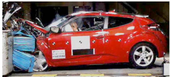
Offset crash test at 64km/h (Euro NCAP)