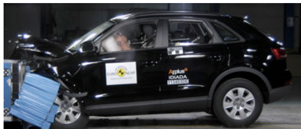
Offset crash test at 64km/h (Euro NCAP)