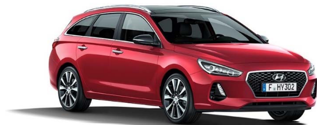
Hyundai i30 wagon