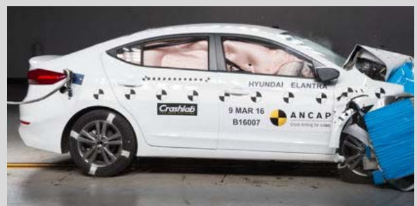
Frontal offset test at 64km/h (Hyundai Elantra)