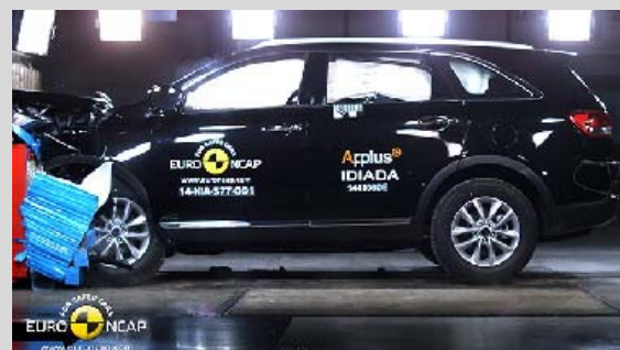
Frontal offset test at 64km/h.