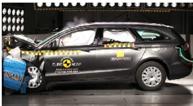
Frontal offset test at 64km/h (Euro NCAP - wagon)