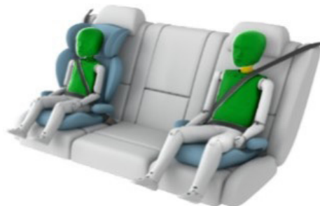
SIDE IMPACT TEST - 60km/h