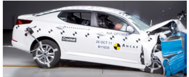
Offset crash test at 64km/h