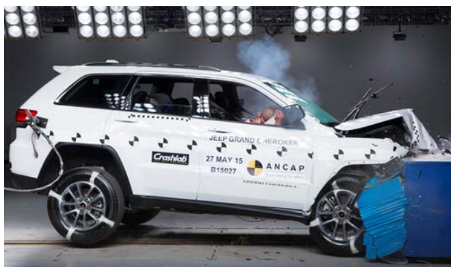
Frontal offset test at 64km/h